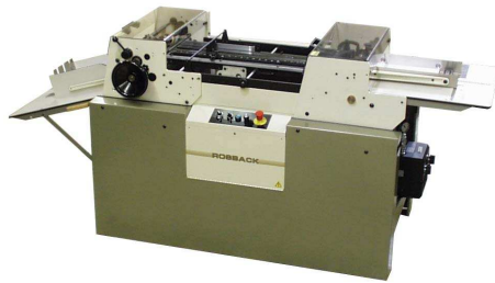
True-Line SR Series