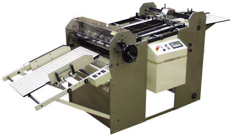
240 and 240XL Series