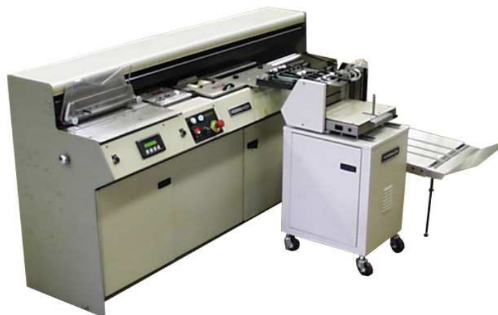
Shown with 882 Perfect Binder