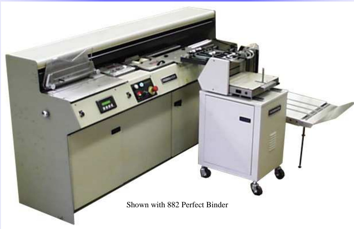
Shown with 882 Perfect Binder