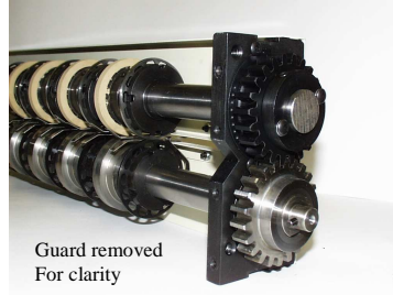
Guard removed For clarity

Modules are heavy duty and built to last. Tooling and blades are proven standard Rosback components