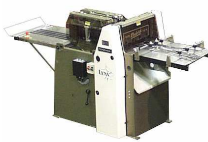
318 F Series Trimmers with Tape Track