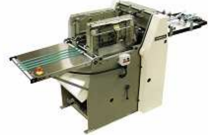
250 FRC Trimmer with Roller Track