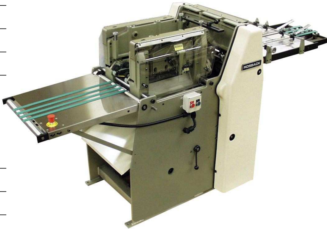
Shown as 250 FRC Trimmer