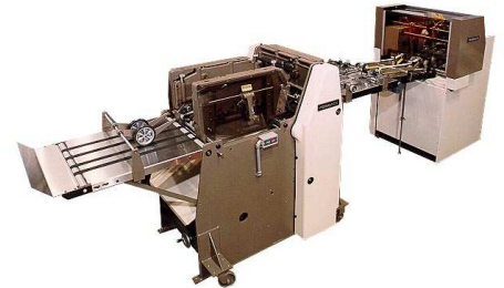
250 CB Trimmer & 953 Feeder Off-Line Trim Solution