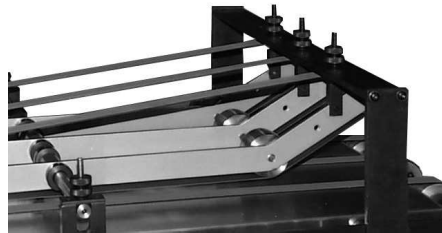
Adjustable in-feed table accepts booklets from any stitch/fold unit.