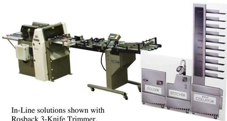
In-Line solutions shown with Rosback 3-Knife Trimmer.