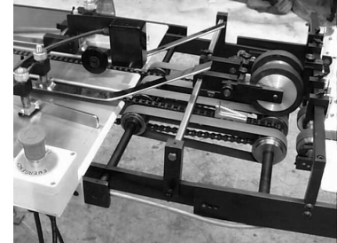
Conveyor unit connects to Rosback 3-Knife Trimmers.