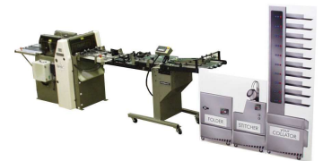
318SA Trimmer and 252 Conveyor with any Tower Collating Unit