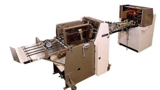
250CB Trimmer & 953 Feeder Off-Line Trim Solution