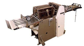
250CB & 250XB Trimmers with Roller Track In-Line Trim Solution