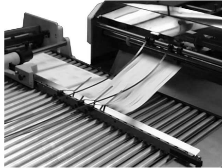
100% Accurate Side Registration