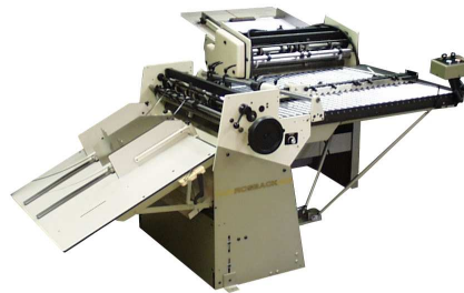
Shown with Model 226 TrueLine