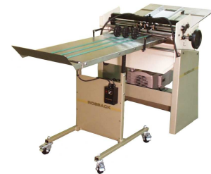
Add a Model 920, 923, or 930 Conveyor to dramatically increase production .