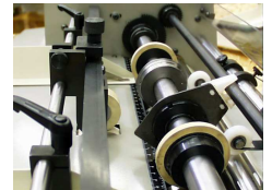
Standard Precision Rosback Heads