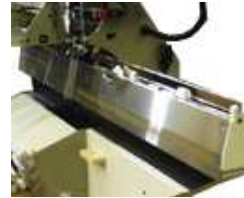
Two-station saddle & feed fingers provide 4x greater productivity compared to pedestal stitchers.