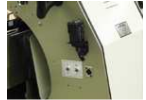
Sensor detects missing signatures over saddle and prevents stitching heads to stitch without a book present.