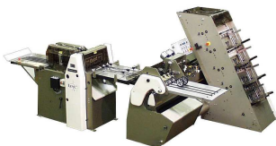
Stitcher within 318 Lynx System