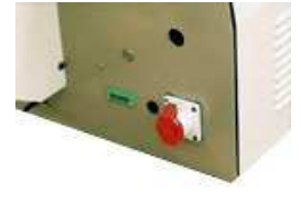
Easy connection for additional feeder and trimmer for your increasing customer demands.