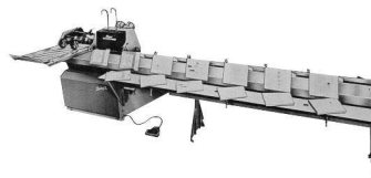
Shown with 213 Saddle Extension