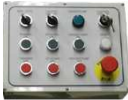
Conveniently located and large visible controls.