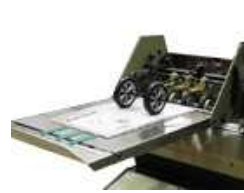
Positive delivery with single lever thickness adjustment of rollers assures positive book control throughout delivery.