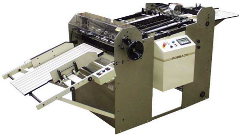
240 and 240XL Series