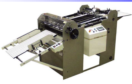
240 and 240XL Series