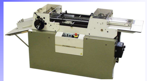
True-Line SR Series