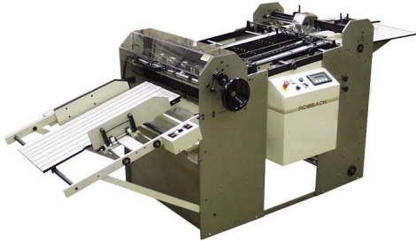
240 and 240XL Series