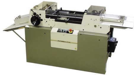
True-Line SR Series