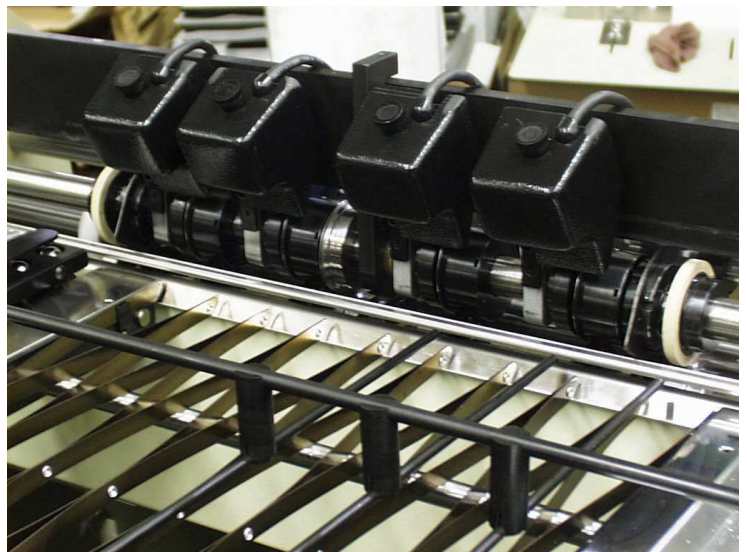
Available on Models 223SRX, 226SRX, 240 XL, 243 XL & 248 Perforators and on Models 223 and 226 Vacuum Truelines

Shipping & Mailing Address: 125 Hawthorne Ave., St. Joseph, MI 49085 Phone: (269) 983-2582 * Fax: (269) 983-2516 * Internet: www.rosbackcompany.com * E-mail: Sales@RosbackCompany.com Manufactured in the USA since 1881