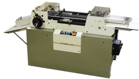
True-Line SR Series