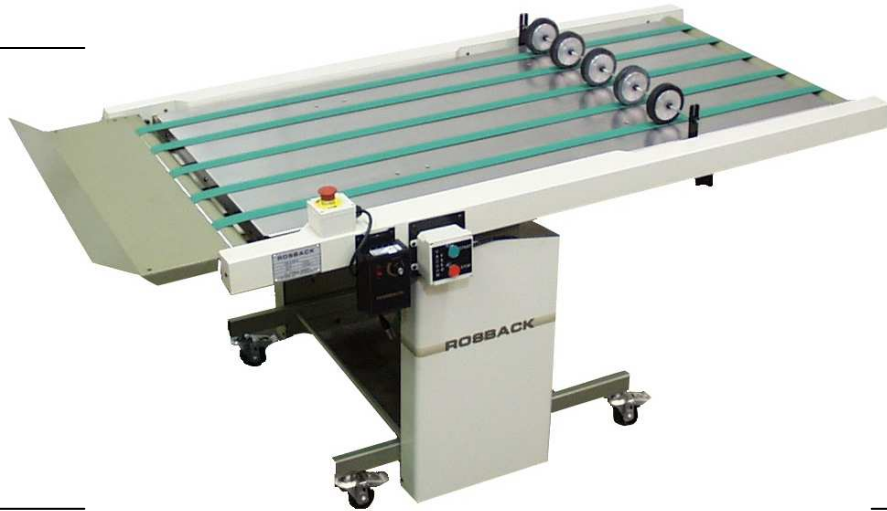
930XL Conveyor Delivery