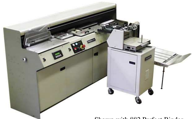
Shown with 882 Perfect Binder

*Contact Rosback for alternate electrical requirements. Design Specifications Subject To Change Without Notice.