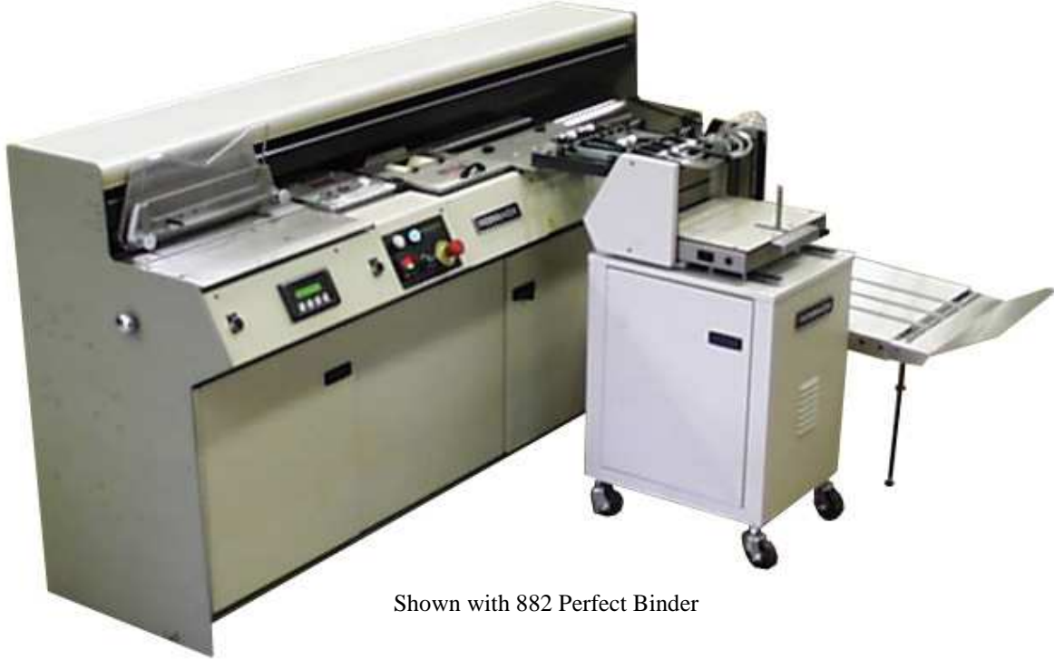
Shown with 882 Perfect Binder