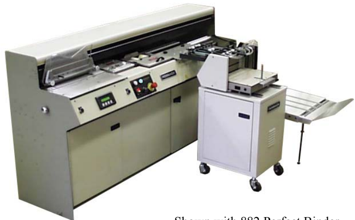
Shown with 882 Perfect Binder

*Contact Rosback for alternate electrical requirements. Design Specifications Subject To Change Without Notice.