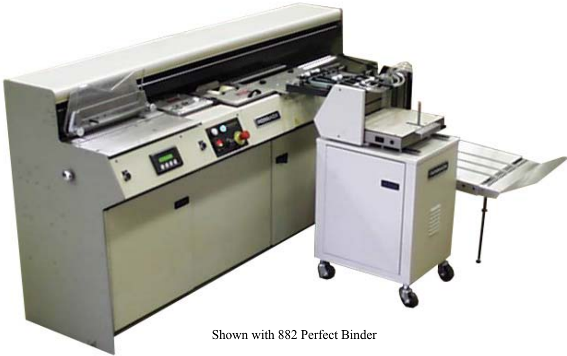
Shown with 882 Perfect Binder