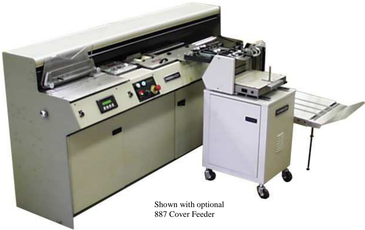
Shown with optional 887 Cover Feeder