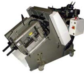
253 Trimmers with Roller Track