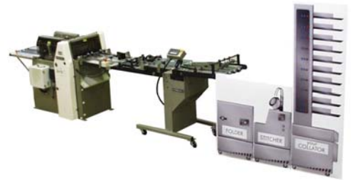
318SA Trimmer & 252 Conveyor with any Tower Collating Unit In-Line Trim Solution