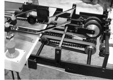
Conveyor unit connects to Rosback 3-Knife Trimmers.