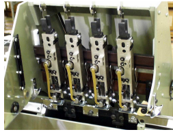
Up to 4 stitching heads can be used at one time. Easily adjustable and removable.