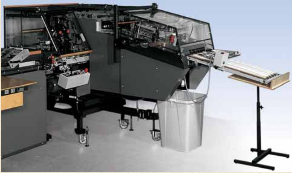
3 knife trimming.

Fibre optics ensure exact alignment of punched products with the highest degree of accuracy.