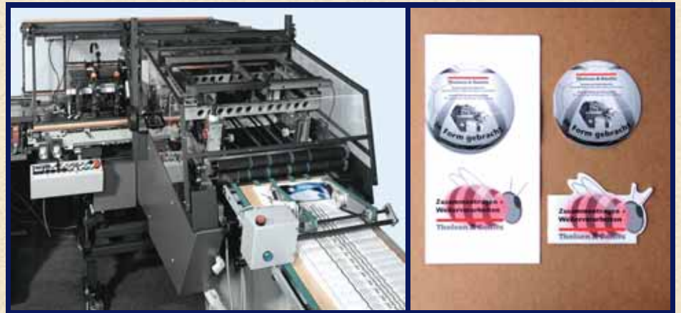
Former punched booklets.

Is a powerful addition to the stitch/fold/trim line to enable multiple production giving an output as high as 12,000 books per hour.