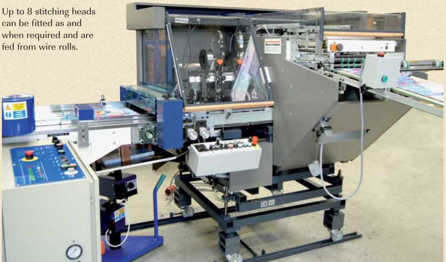
Transfer from collator to booklet maker.

A special fold knife design gives added friction to the set as it is taken into the fold rollers and thereby ensures a consistent finish.